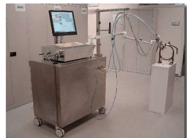
Construct temperature and EMC safe housings

Phone +49-6221-13803-00 Fax +49-6221-13803-01 info@mrc-systems.de www.mrc-systems.de