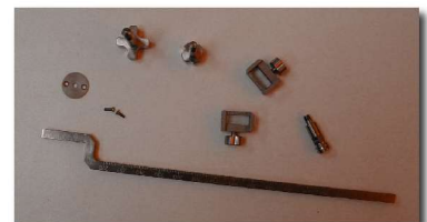
Manufacture simple but accurate spare parts