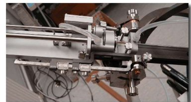
Establish minimal invasive stereotactic laser probes